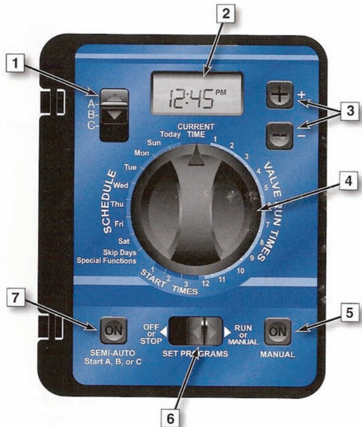
FIGURE NO. 4

Push button used to manually start P program A, B, or C cycles (as selected) or the Station Test Run feature.